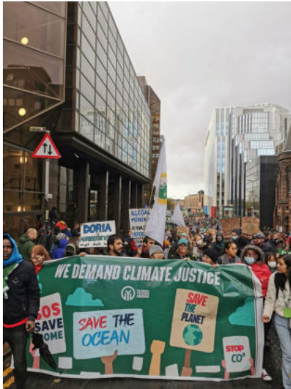
Pic4: March at Global day of action

GYG coordinated with the European Greens Party, the Greens/EFA, Global Greens, Scottish Greens for the "Green Hub" which was the meeting point for the Green family from across the world to network at Glasgow, attend events, meet other green actors, rest and recharge, there were hybrid events and an online element at the hub too. Many of the GYG delegates from global south were the speakers at the sessions of green hub. Also, together with Federation of Young Greens of Europe (FYEG) and Scottish Young Greens (SYG) GYG organised a "Youth hub" inside the green hub where several interesting sessions were organised by GYG . There were sessions on "How the Global North can support the Global South", "Young Greens in Parliament" with 2 MSP's, one MP from Rwanda, 1 senator from Australia, etc. The sessions had good participation physically and virtually. GYG also released a joint statement with FYEG on the outcome of COP which can be read here .