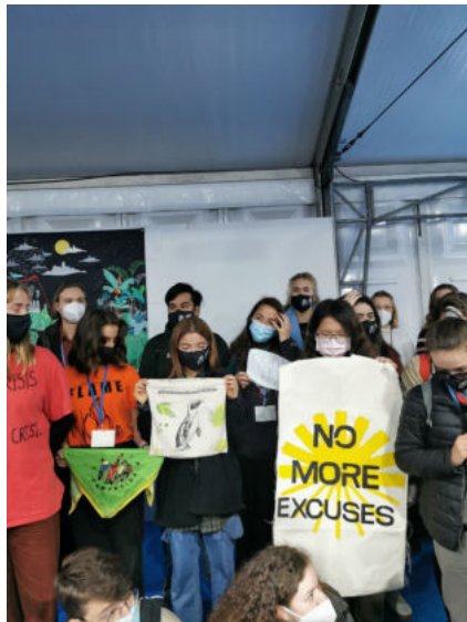
Pic3: Protest inside the COP venue

beginning that young greens/activists from Global South would be prioritised. GYG had 12 delegates in total out of which 6 were from the Global South. Even after having the accreditation from UNFCCC it was difficult for young greens from Global South to be a part of COP 26 in Glasgow, UK because of several restrictions on travel, visa etc by the UK government.