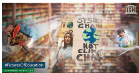
Pic2: Graphic of the program of UNESCO

It was a nice experience working with the team of UNESCO in this initiative. The results of focus groups discussions helped them to understand the future of education from the perspective of youth and young greens and would be included in the next global report of UNESCO on the future of education.