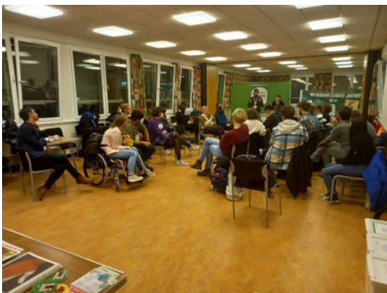
Pic5: A session at green hub

GYG coordinated with the European Greens Party, the Greens/EFA, Global Greens, Scottish Greens for the "Green Hub" which was the meeting point for the Green family from across the world to network at Glasgow, attend events, meet other green actors, rest and recharge, there were hybrid events and an online element at the hub too. Many of the GYG delegates from global south were the speakers at the sessions of green hub. Also, together with Federation of Young Greens of Europe (FYEG) and Scottish Young Greens (SYG) GYG organised a "Youth hub" inside the green hub where several interesting sessions were organised by GYG . There were sessions on "How the Global North can support the Global South", "Young Greens in Parliament" with 2 MSP's, one MP from Rwanda, 1 senator from Australia, etc. The sessions had good participation physically and virtually. GYG also released a joint statement with FYEG on the outcome of COP which can be read here .