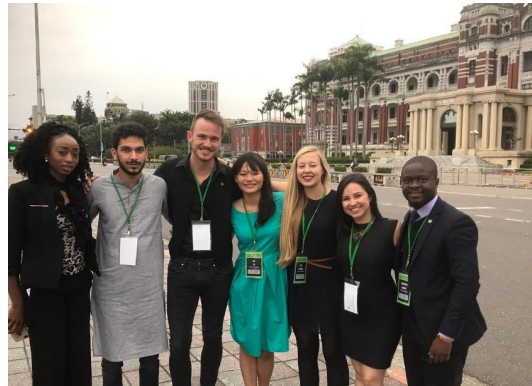
Young Greens meet Minister of Environment of Taiwan, Lee Ying-Yuan (top left), delegates discuss youth empowerment in politics (top right), GYG at Taipei Gay Pride Parade (bottom left), GYG Steering Committee outside Taiwan Presidential Palace (bottom right).