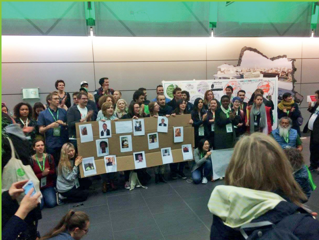
The rally against visa controls