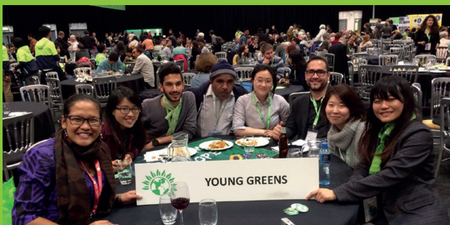
A few Young Greens from Asia