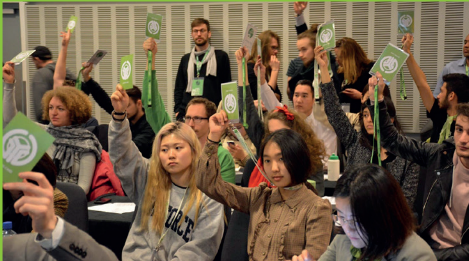
Discussion on the future of Global Young Greens