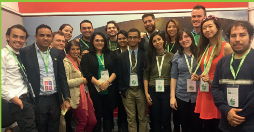
Delegates from the Americas