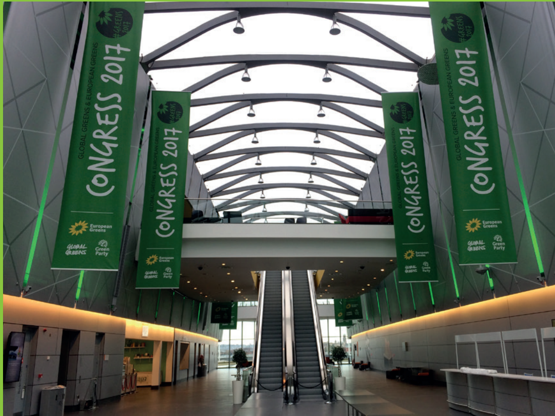
The conference hall