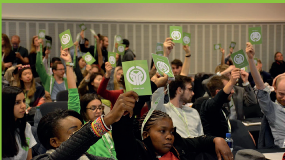
Delegates casting their votes